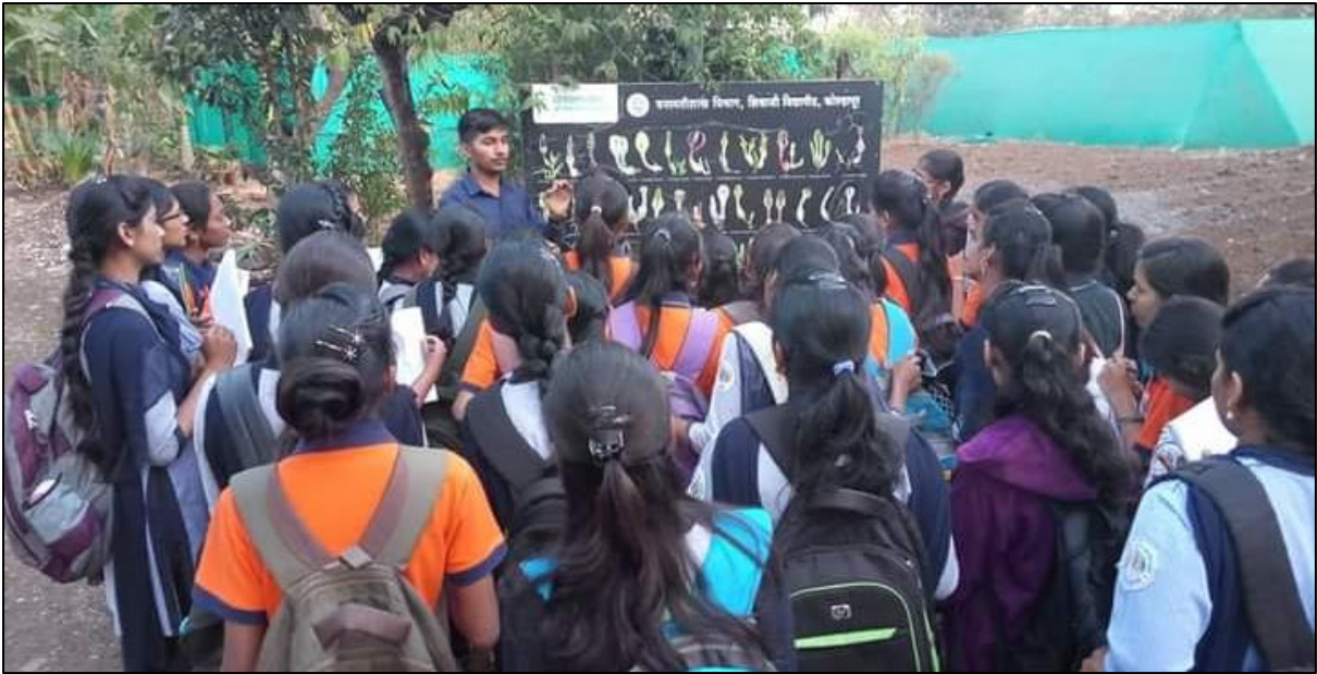
Research Scholer describes diversity of genus Ceropegia collected from Westen Ghats