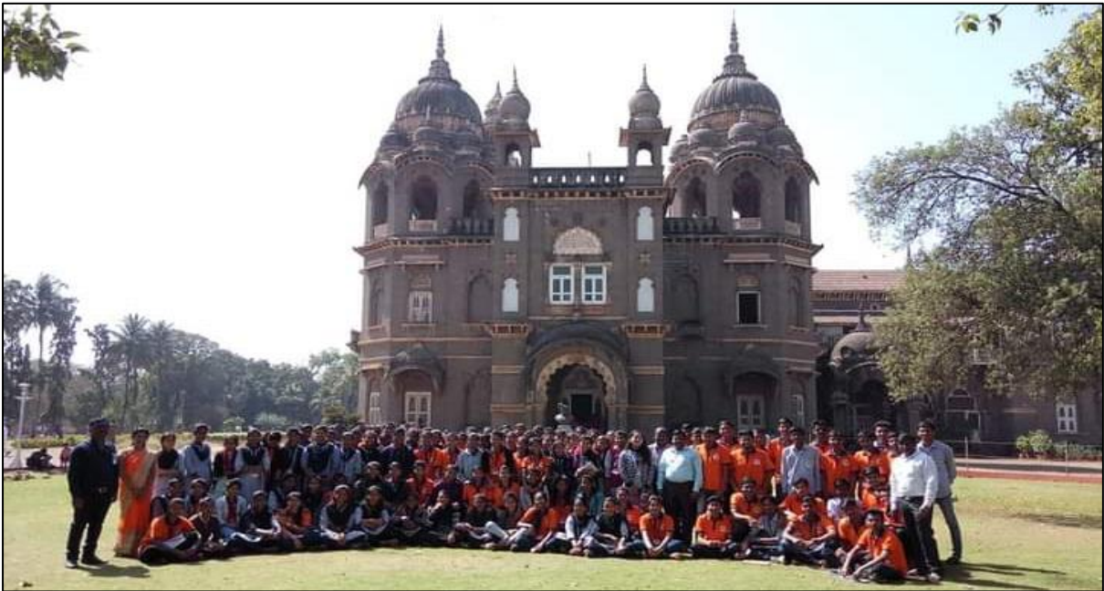
Students and Faculty at New Palace, Kolhapur