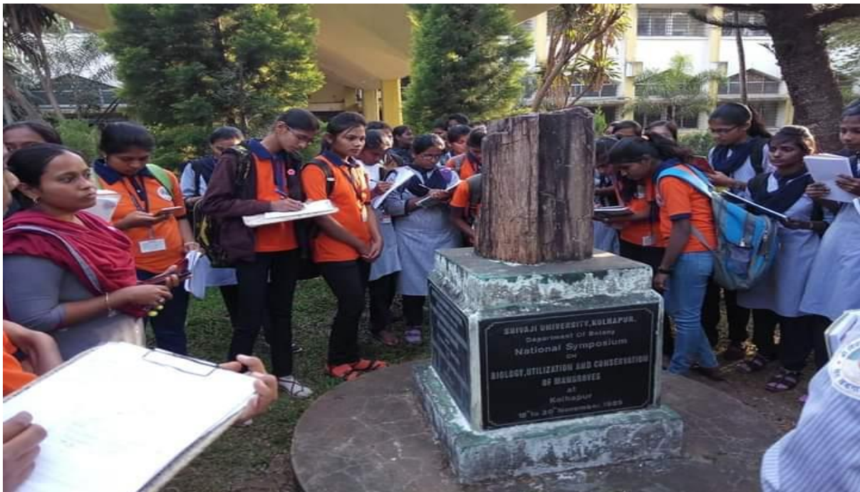
Students observing Petrified Fossil at Botany Department, Shivaji University, Kolhapur