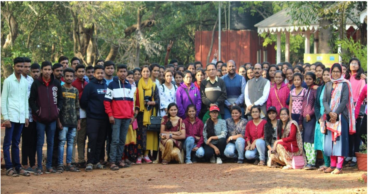
Students with Faculty and Director of Wheat Rust Research Centre at Mahabaleshwar