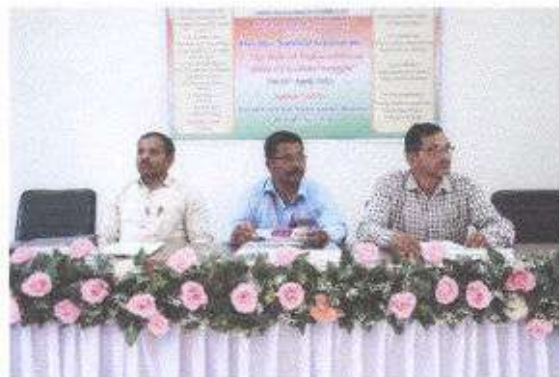
Some Paper presenters of the seminar