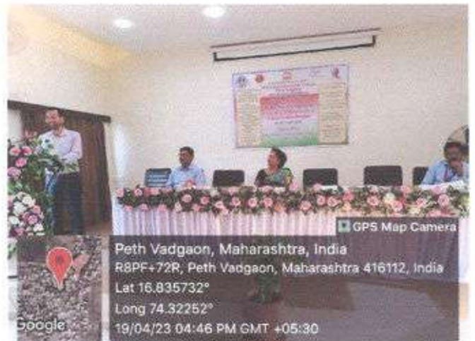
GPS photos of National Seminar