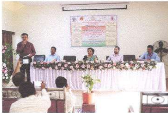
Sharing their experience by the participants