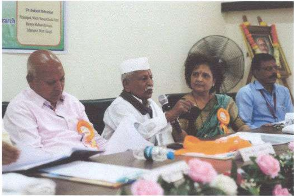
Hindurao Ganpati Jadhav (Freedom Fighter) Opinion of freedom fighter.