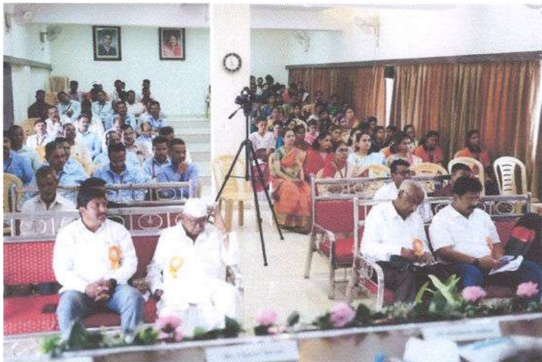
Participants of Inaugural Function of the National Seminar