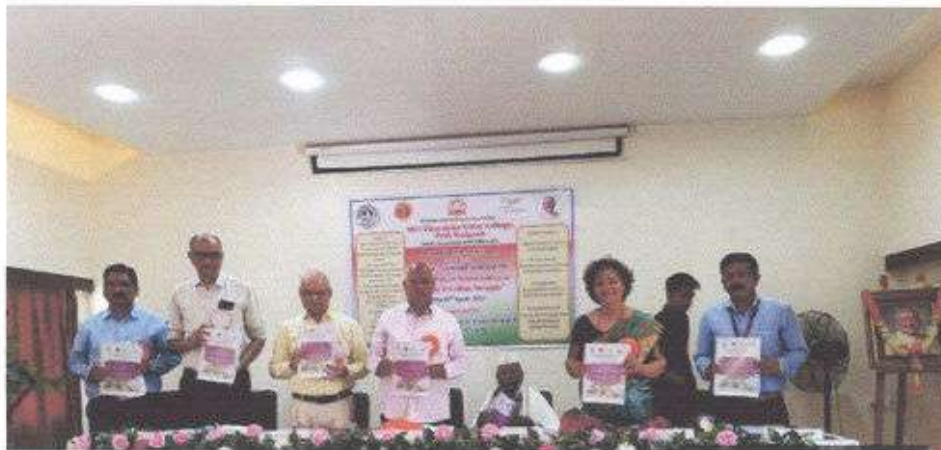
The 'Abstract book' of the research papers released by the guests