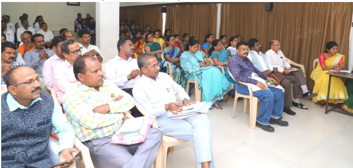
Delegates present for the workshop