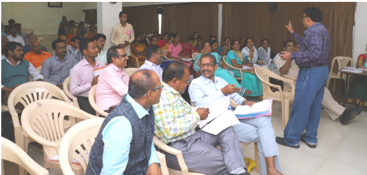
Discussion on the queries of the participants