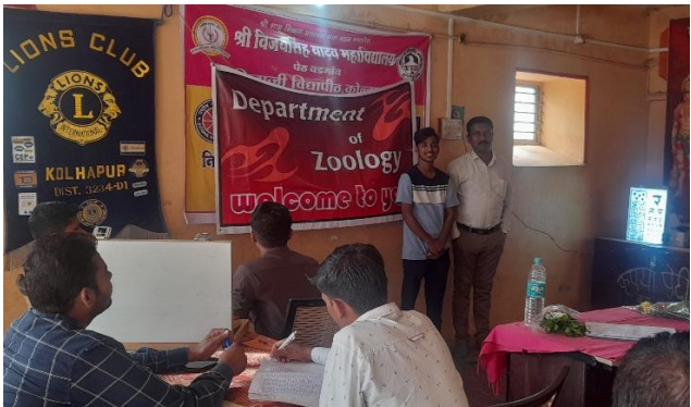
Team of doctors from Lions Club of Kolhapur's Lions eye hospital Kodoli and Teachers with students of Zoology engaged in checking eyes.