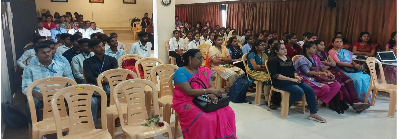
Participants present for workshop