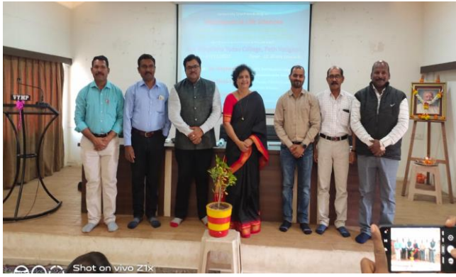
Inauguration by Watering plant