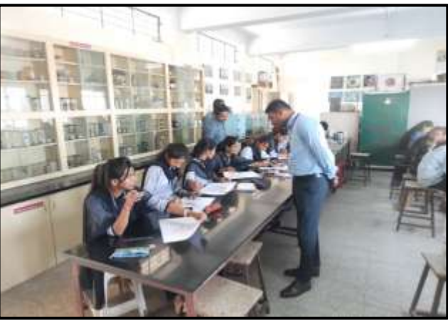
Participants involved in sketching competition