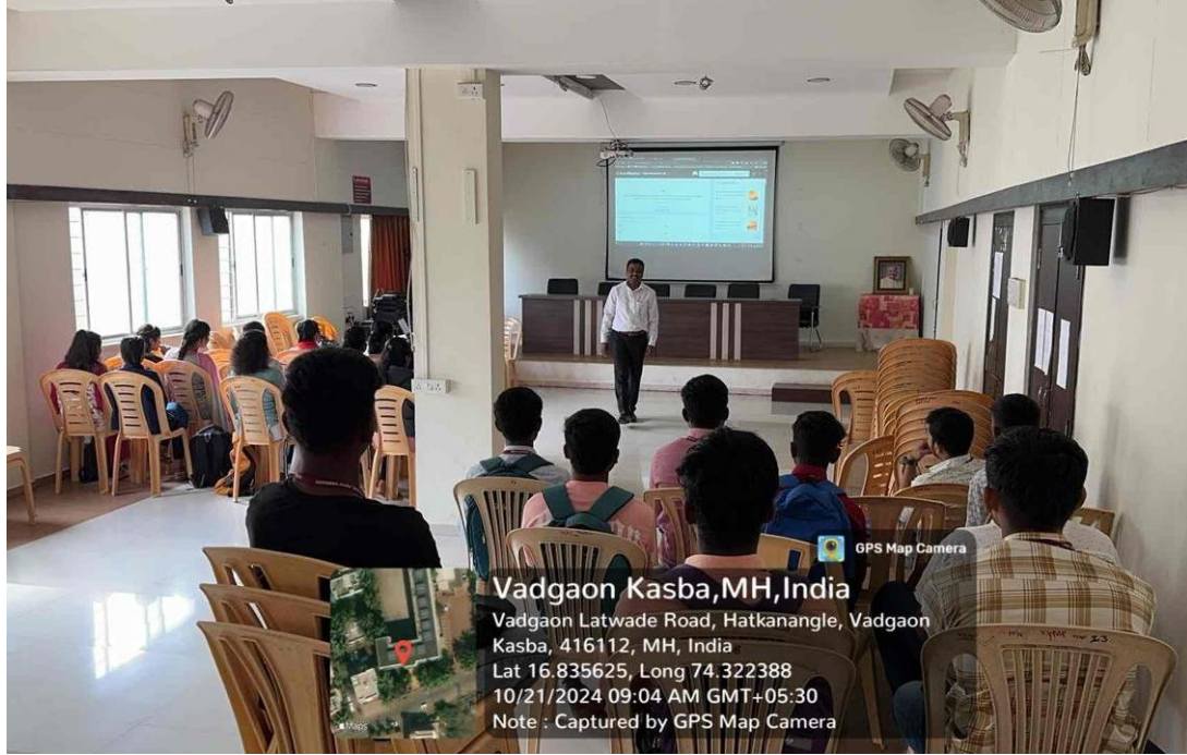
Photo plate of the Programme