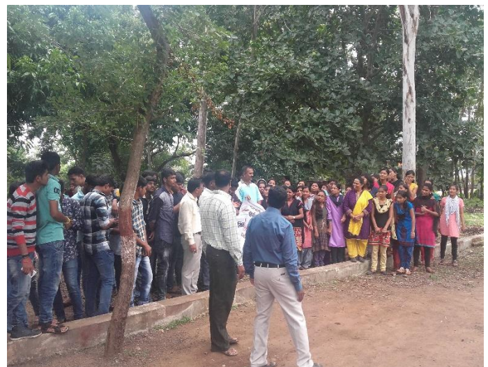
Police Station Cleanliness