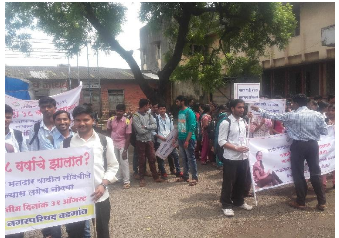
Voter Awareness Rally