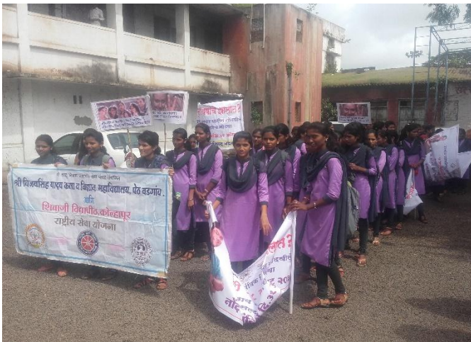
Voter Awareness Rally