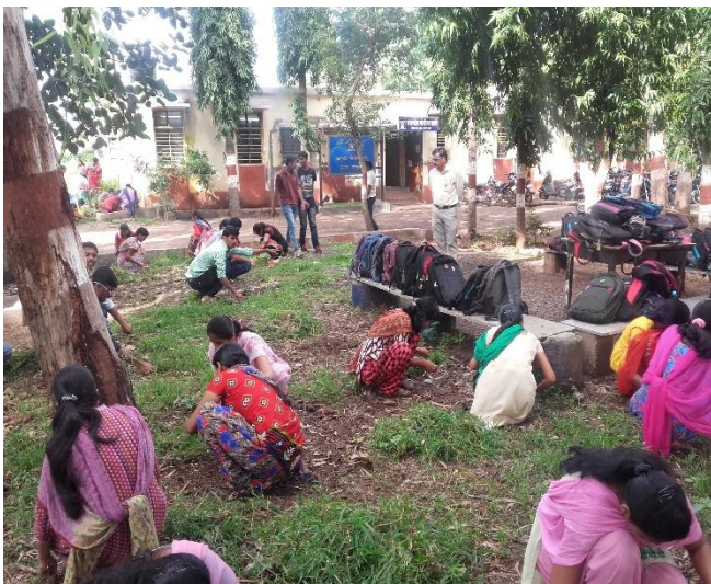
Police Station Cleanliness