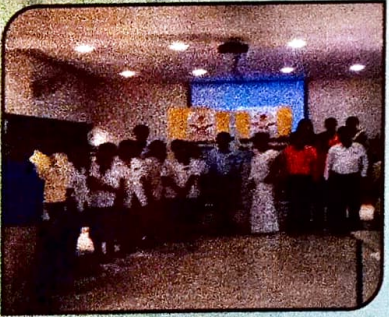
आरोग्य समिती मार्फत मोफत दंत तपासणी शिबीर