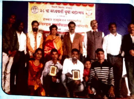
मध्यवर्ती युवक महोत्सव शि. वि. कोल्हापूर मध्ये बक्षीस स्वीकारताना विद्यार्थी व प्राचार्य