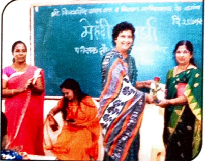
मेहंदी स्पर्धेचे आयोजन