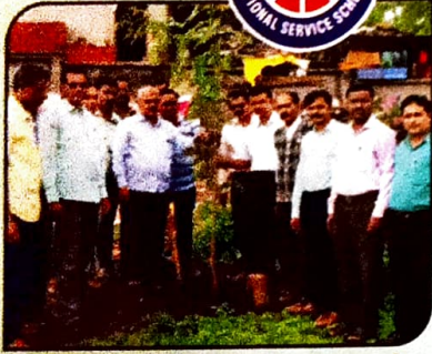
वडगांव बाजार समिती परिसरात वृक्षारोपण