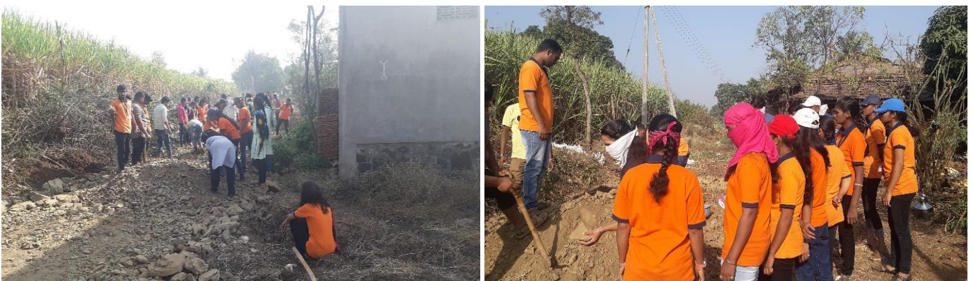
NSS Volunteers spreading murum on Road