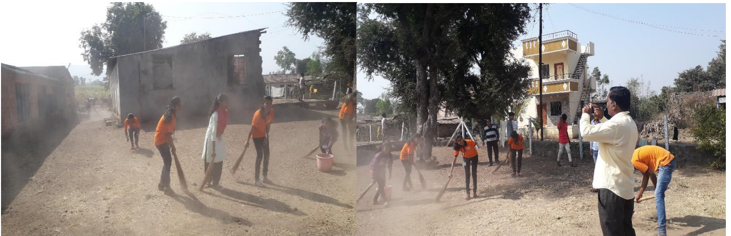
NSS Volunteers cleaning Road