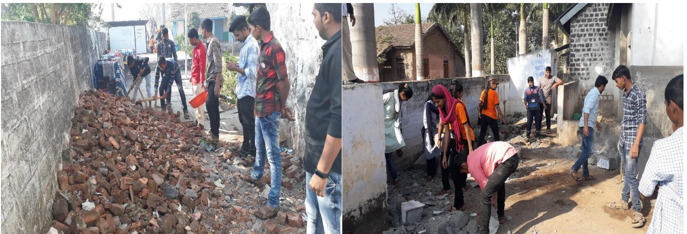
NSS Volunteers cleaning school