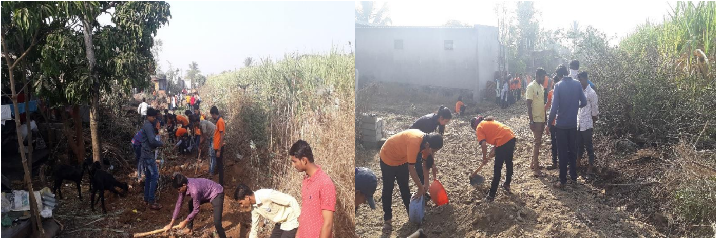
NSS Volunteers spreading murum on Road