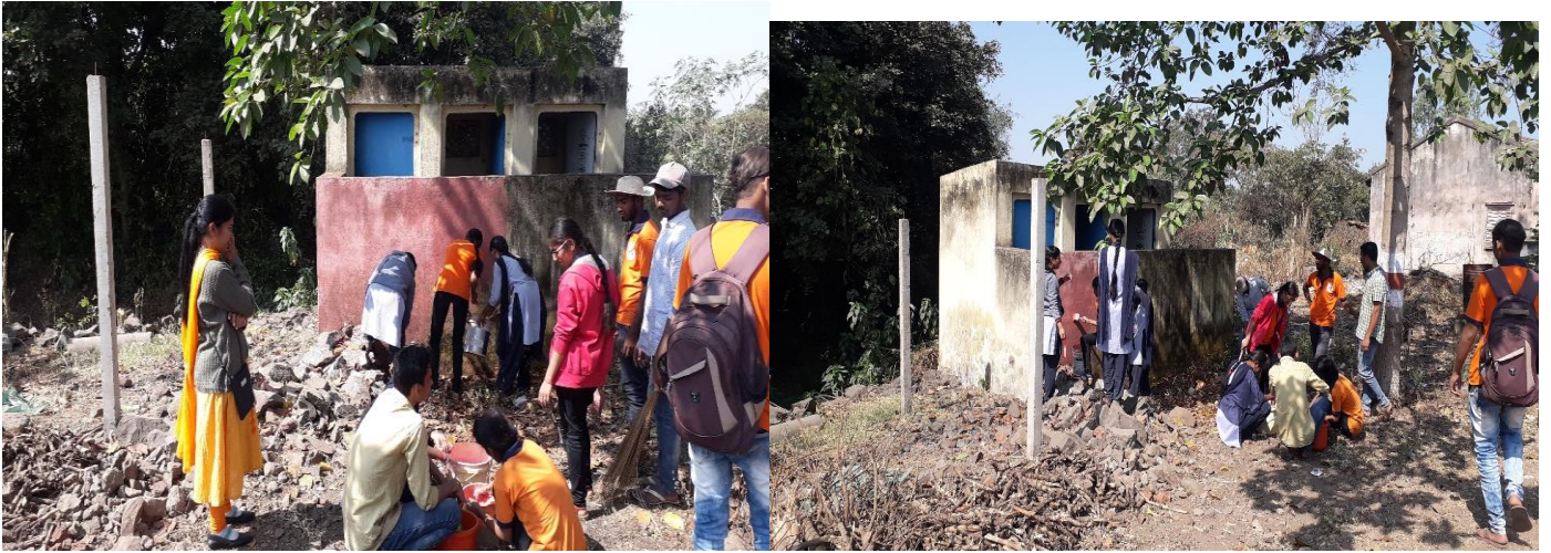
NSS Volunteers painting Public walls