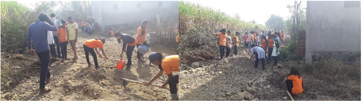
NSS Volunteers spreading murum on Road