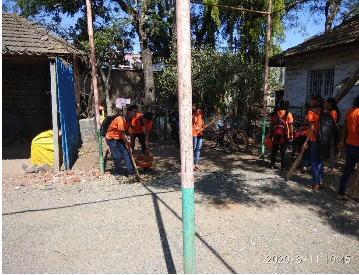
Balvantrao Yadav Hospital Shramdan