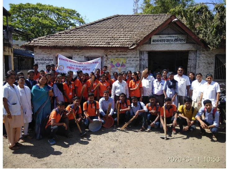
Balvantrao Yadav Hospital Shramdan