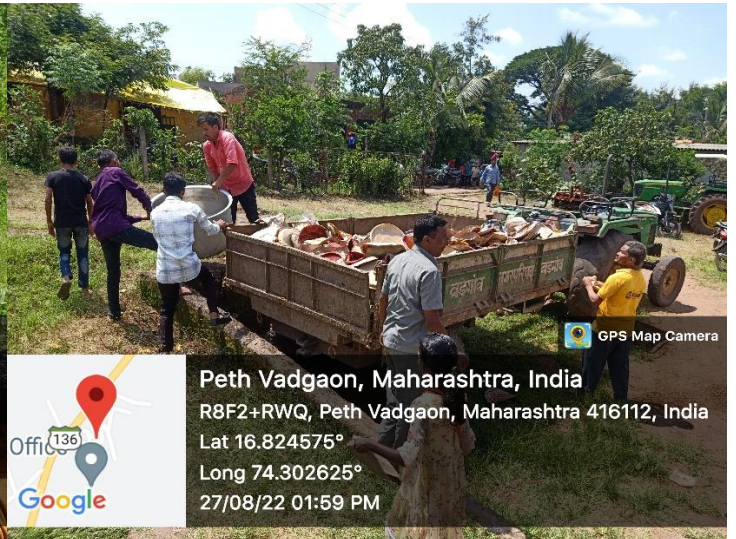
NSS Volenteers cleaning Mahalaximi Mandir campus