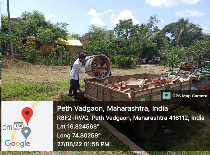
NSS Volenteers cleaning Mahalaximi Mandir campus