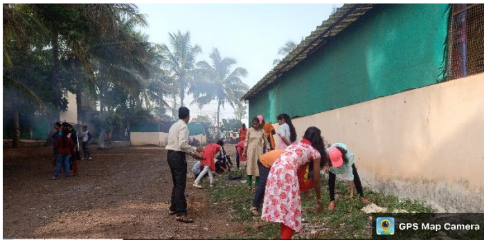
NSS Volenteers cleaning college campus