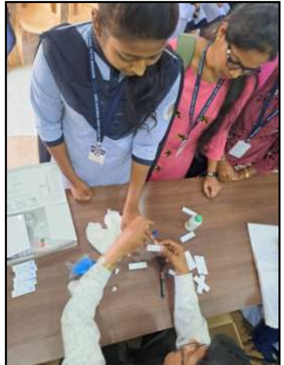
Testing of Blood of students for HIV-AIDS