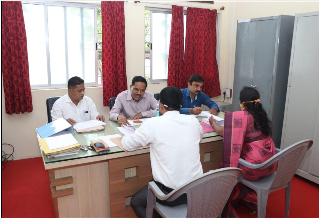
Assessment process of AAA Committee