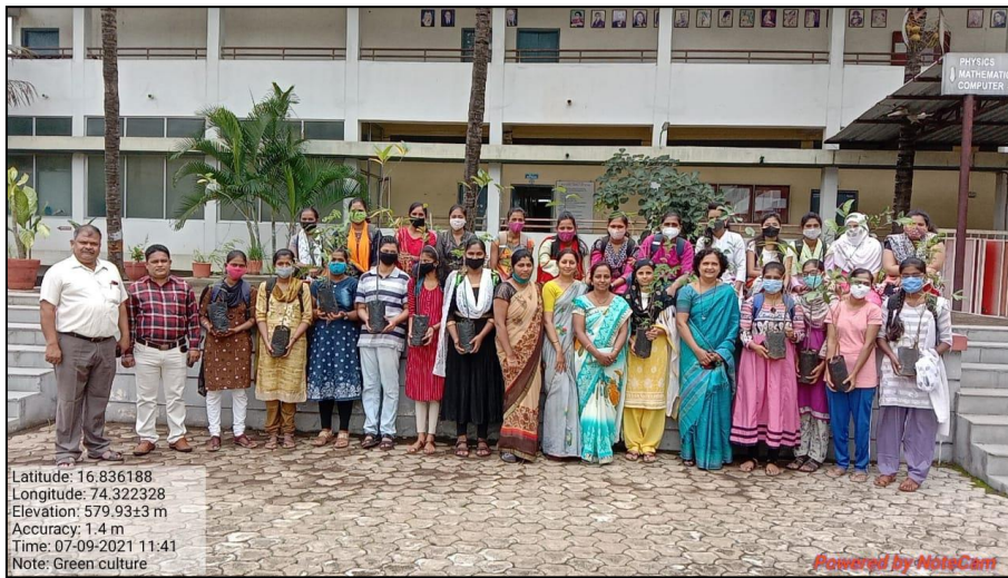
Photo plates of the plantation