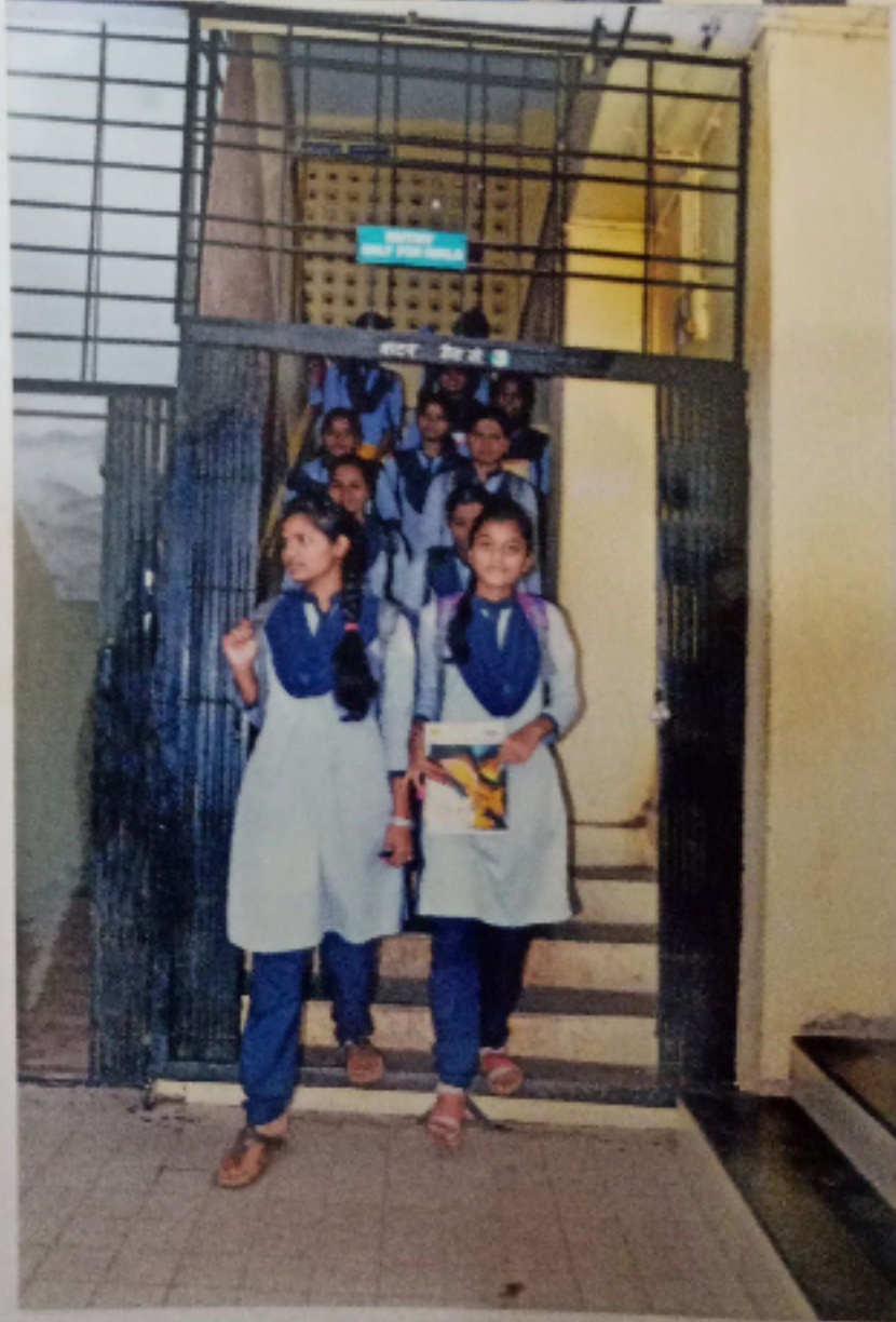
Separate steps for secure our girls students staircase