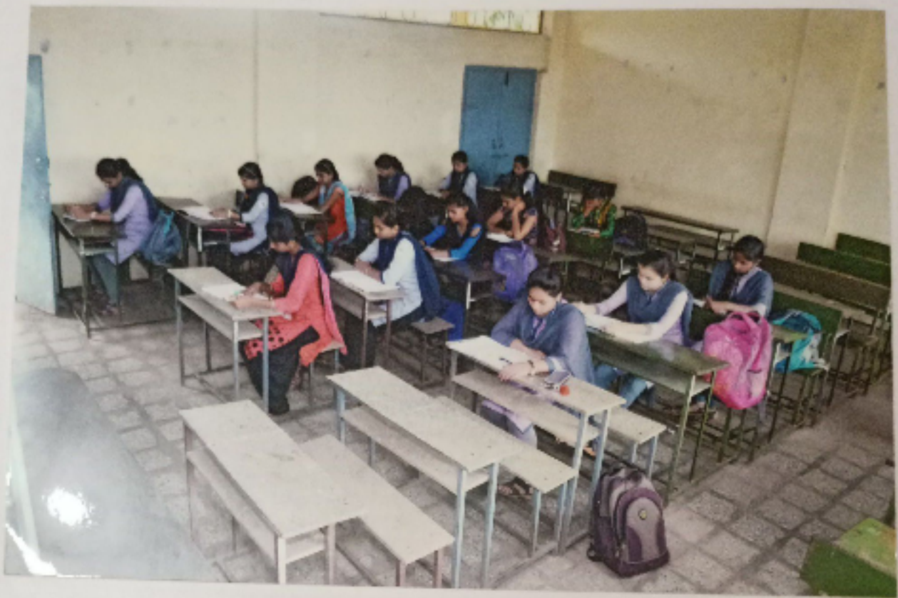
Common Room for Girl Students