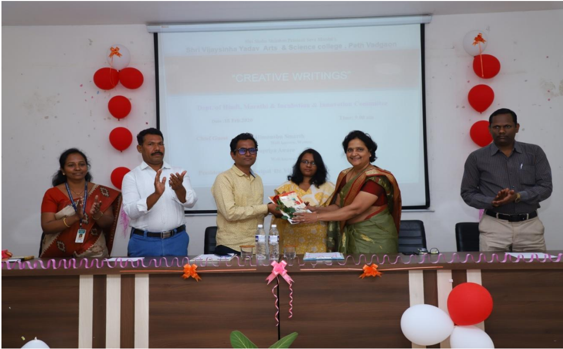
Workshop on Creative Writing