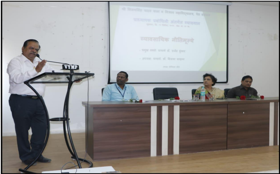
Lecture on Professional Ethics