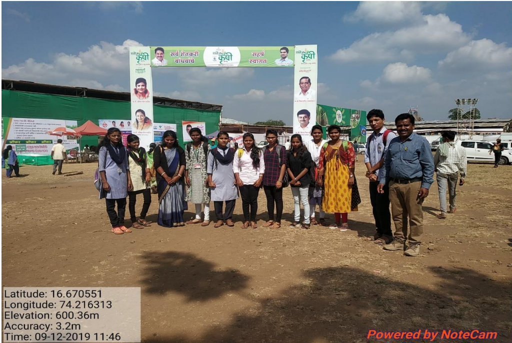
Agricultural Exhibition Visit