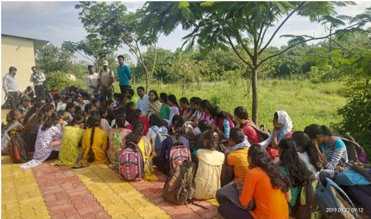
Participation in Bird Census