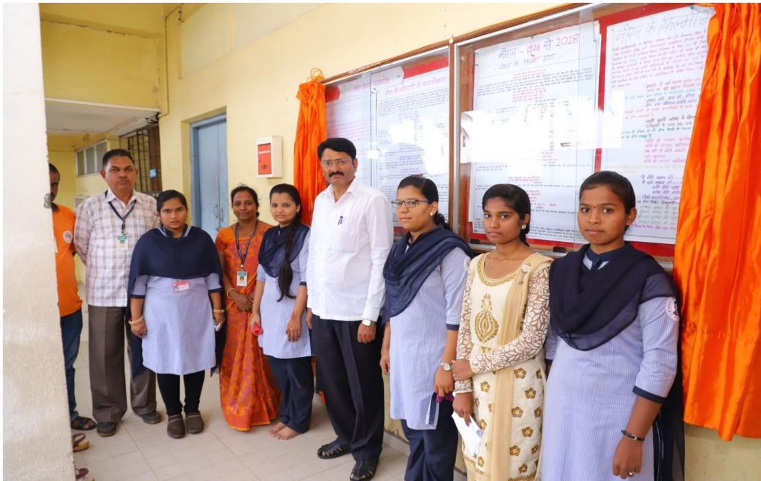
Celebration of Hindi-Day