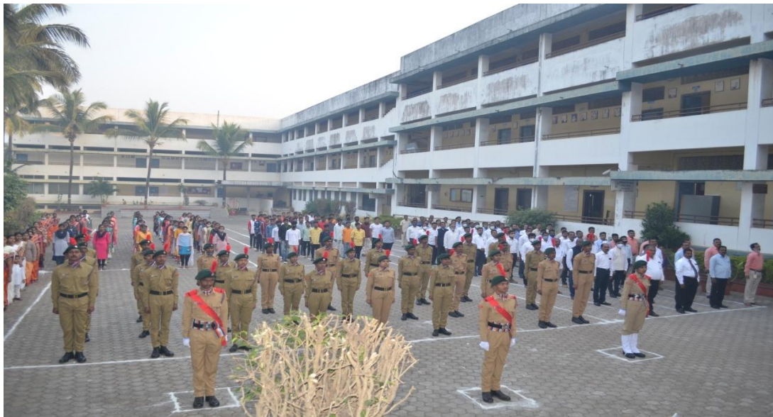
Celebration of Independence Day