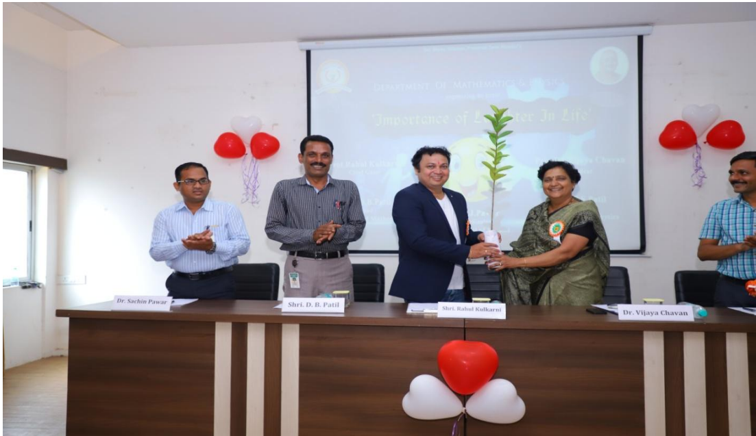
Importance of Laughter in Life