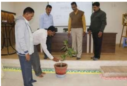
Chairman, Vivek Vahini