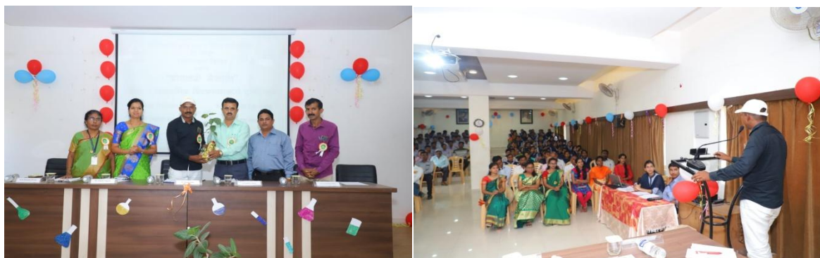
Wall Paper Competition- Dept. of Chemistry