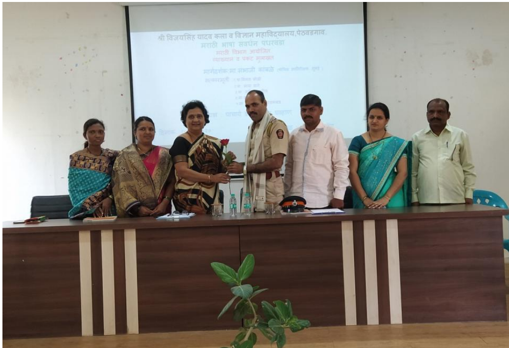
Felicitation on SET pass