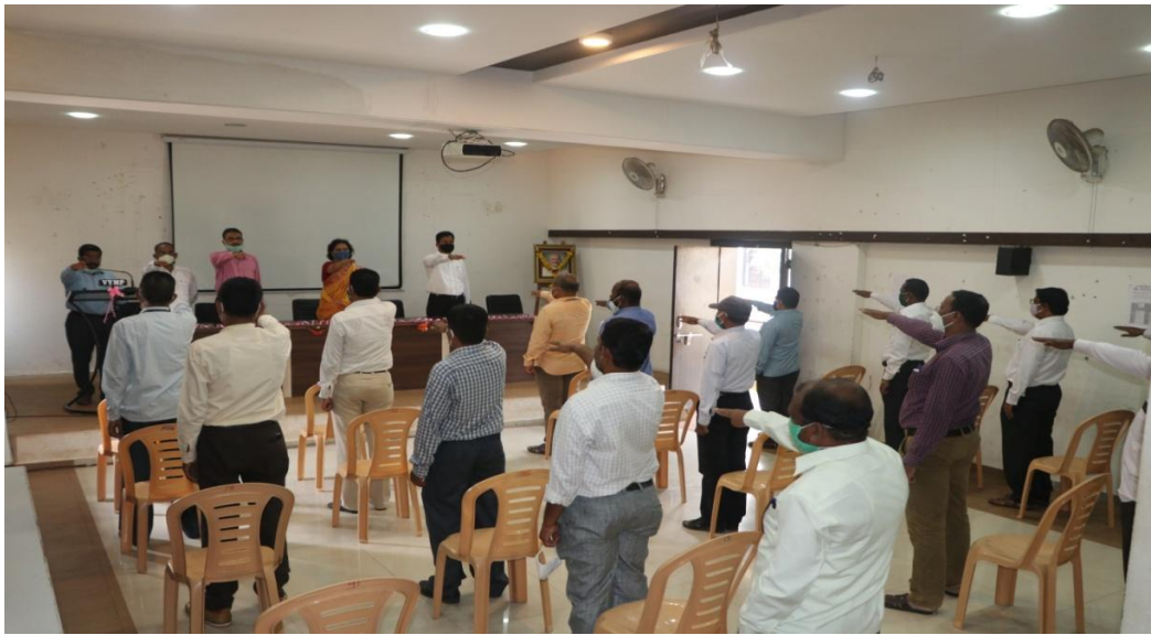
Oath on Indian Constitution Day