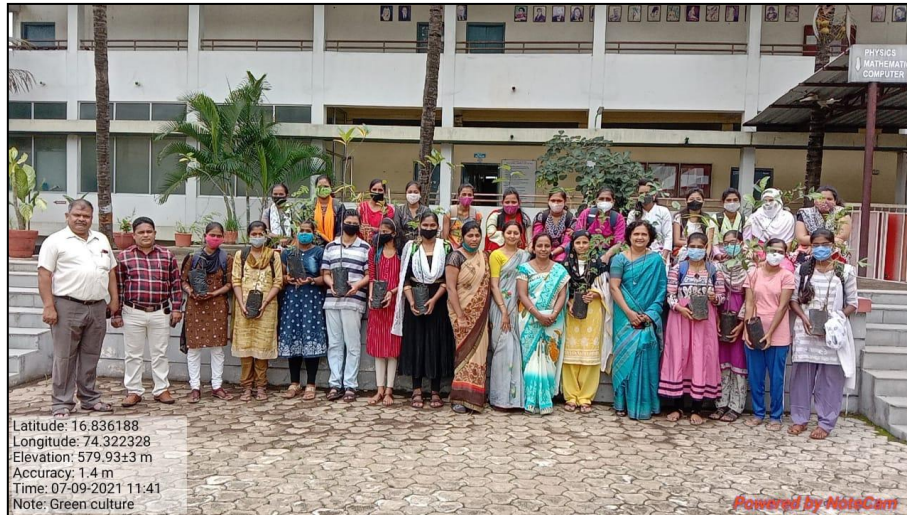
Photo plates of the plantation

ideas other staff members also motivated and desired to buy electric bikes. Two (02) faculties are using CNG Cars to minimize the level of pollution and saving the petrol.