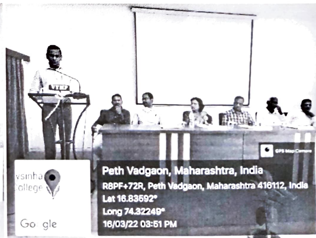
Opinion by one of the faculty about Seminar