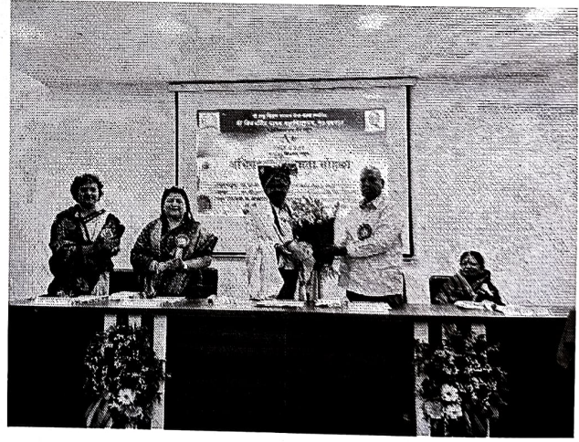
Welcome of Chief Guest